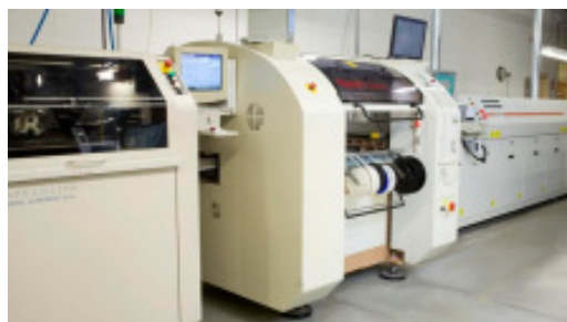
Equipment manufacturers' company and brand names are trademarks of their respective owners.